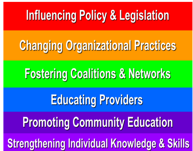
FIGURE 3 – THE SPECTRUM OF PREVENTION

High utilizers have immediate co-occurring medical and social needs that are being addressed by healthcare. In addition, healthcare has an opportunity to leverage existing prevention efforts at the community level to exponentially improve the likelihood for successful clinical interventions to reduce high utilization. A primary prevention approach will help existing high utilizers restore and maintain their health, while services and strategies are needed to tend to more immediate needs.