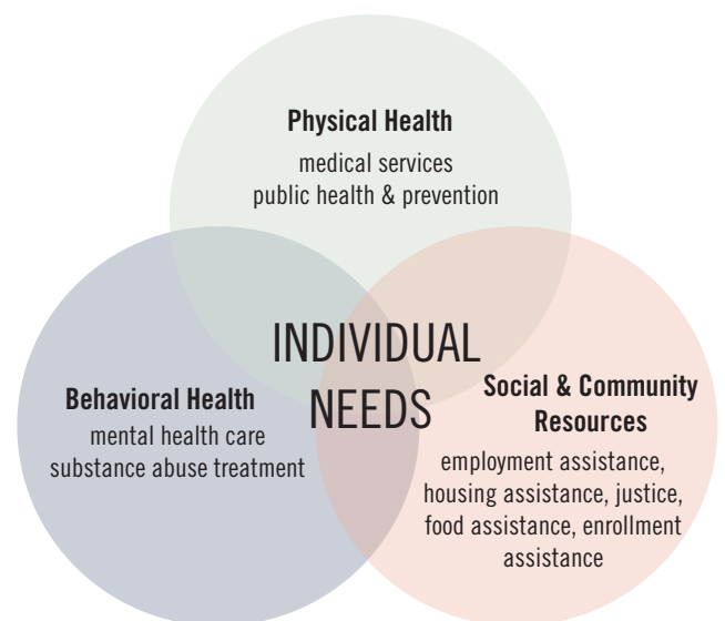
Exhibit 3. Whole-Person Care Model

Exhibit 3 depicts the numerous public services and systems that individuals in the safety net might interact with, including physical health (e.g., primary care, specialty care, hospitals), mental health, substance use treatment services, criminal justice, public health, and social services. Social services can include eligibility for Medicaid and other public programs such as the Supplemental Nutrition Assistance Program (SNAP/ CalFresh), Women, Infants, and Children (WIC), or general relief assistance. It can also include direct services, such as housing, foster care, and employment assistance. The degree to which these various systems are communicating and coordinating with one another at the system level represents one aspect of how whole-person care is operationalized at the patient level.