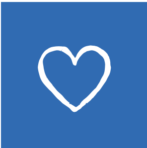
Healing and prevention